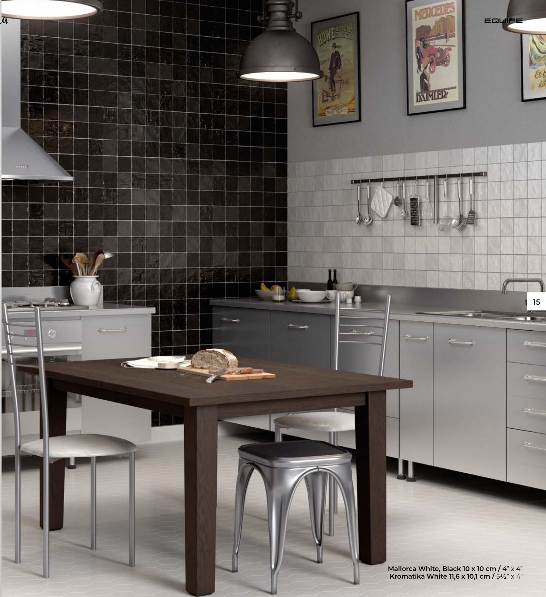
Mallorca White, Black 10 x 10 cm / 4" x 4" Kromatika White 11,6 x 10,1 cm / 5½" x 4"