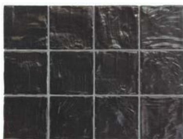
Black 23262 EQ-4