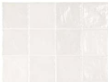
White 23257 EQ-3