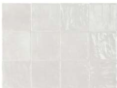
Grey 23259 EQ-3