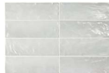
Blue 23254 EQ-3