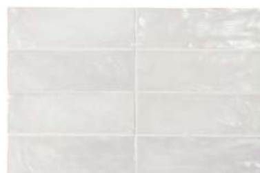
Grey 23253 EQ-3