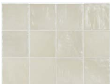
Green 23261 EQ-3