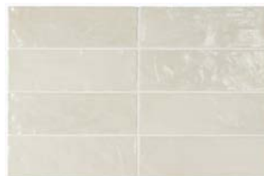
Green 23255 EQ-3