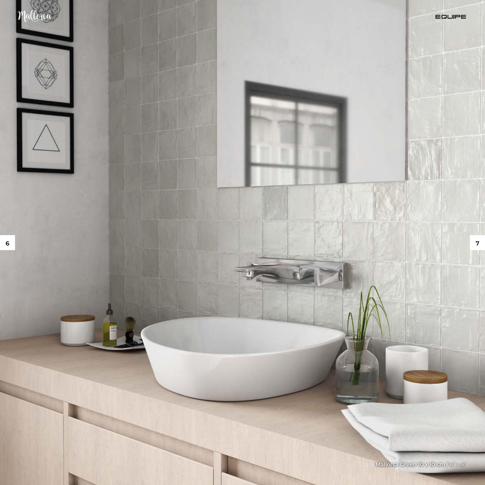
Mallorca Green 10 x 10 cm / 4" x 4"