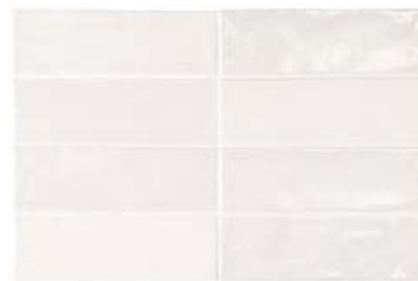
White 23251 EQ-3