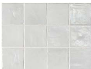
Blue 23260 EQ-3