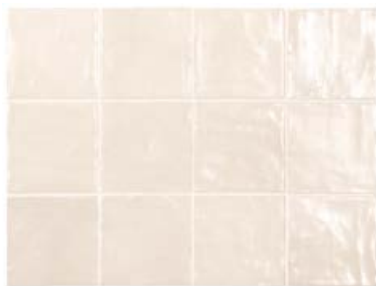
Cream 23258 EQ-3