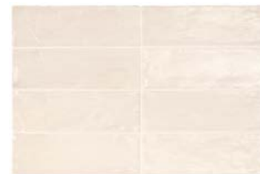
Cream 23252 EQ-3